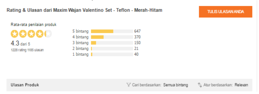
Fig. 1. Rating and Previous Buyers' Comments (www.Lazada.co.id)

Result of the present research is previous buyers' comments have significant influence on the next buyers. If many buyers give positive comments about a product on e-commerce like Lazada, this can influence the next buyers.