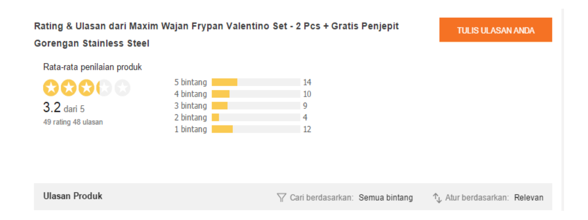
Fig. 2. Rating and Previous Buyers' Comments (www.Lazada.co.id)

The product shown on Figure 1 is similar to the product on Figure 2. They have same brand and quality. The difference is Figure 2 offers free stainless steel fried clasps. However, its rating and comment are lower than Figure 1 which is its 5 stars only obtain 14, its 4 stars only obtain 10, its 3 stars get 9, its 2 stars obtain 4, and its 1 star gets 12. This product has the lowest rating and comment score otherwise it has offered bonus of purchasing in form of stainless steel fried clasps.